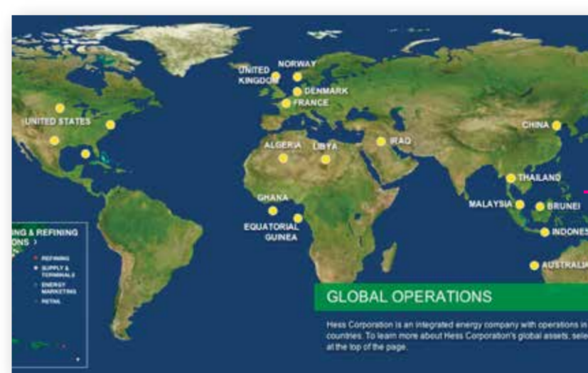
Learn more about Hess and our global operations