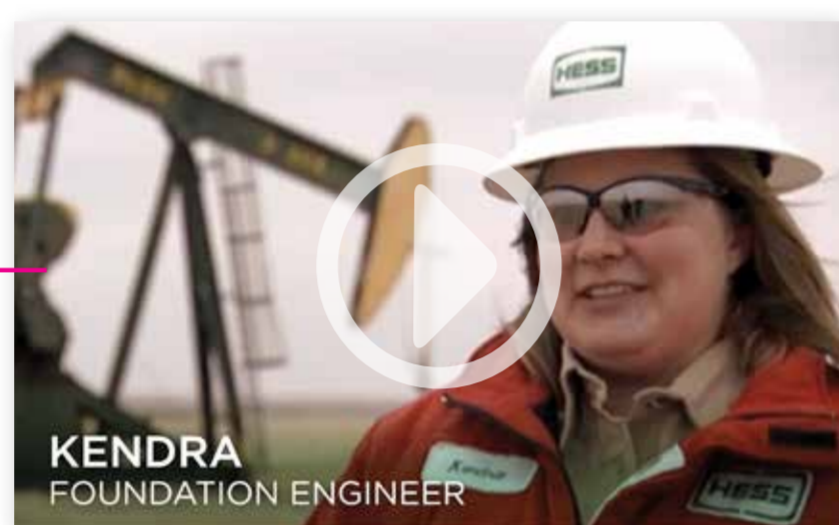
Hear about my experiences at Hess